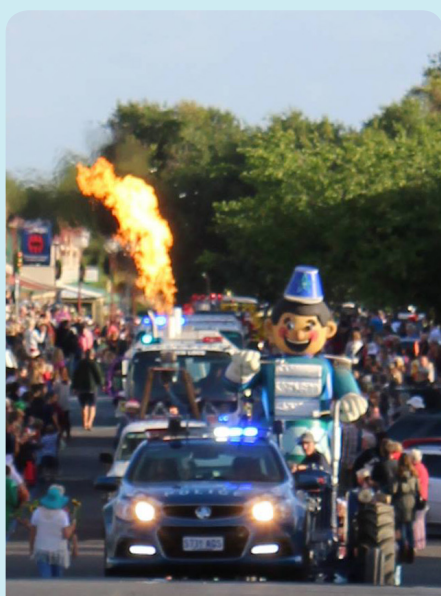
The parade coming up Dawson St

Special thanks goes out to all volunteers who supported with the pageant on the day. The event and our Drummer Boy float would not have been possible without your support.