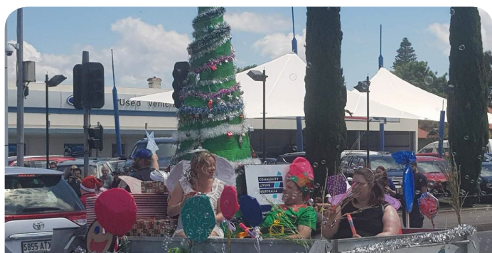
The Community Living Australia Float

We look forward to taking part again later this year!