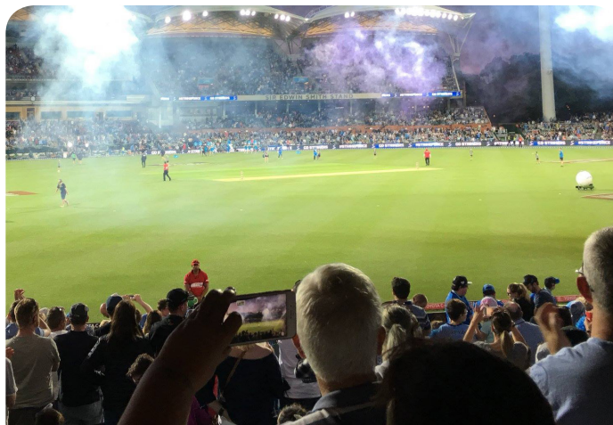
The view from the stands