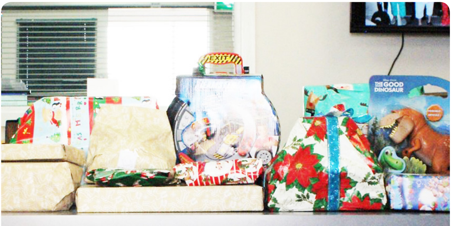
Just a few of the gifts donated by the Tailem Bend Auto Club, AC Care and Salvation Army

"As a not-for-profit organisation, contributions such as this help us bring joy to the children we support."