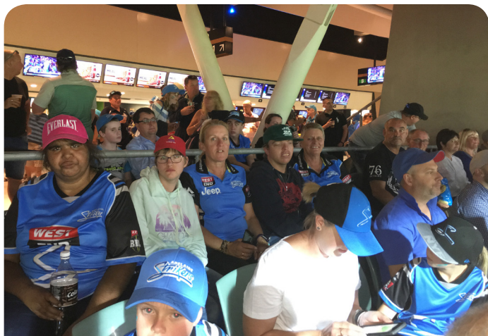
The crew enjoying the Strikers game at Adelaide Oval