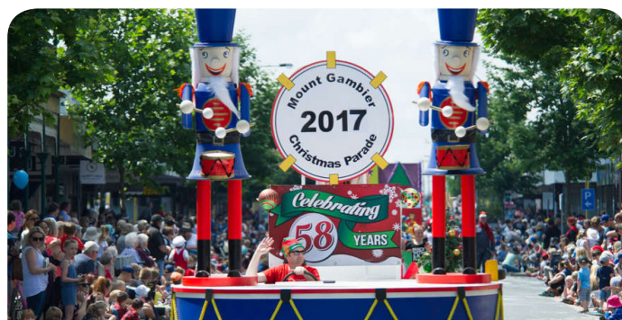
Mount Gambier Christmas Pageant