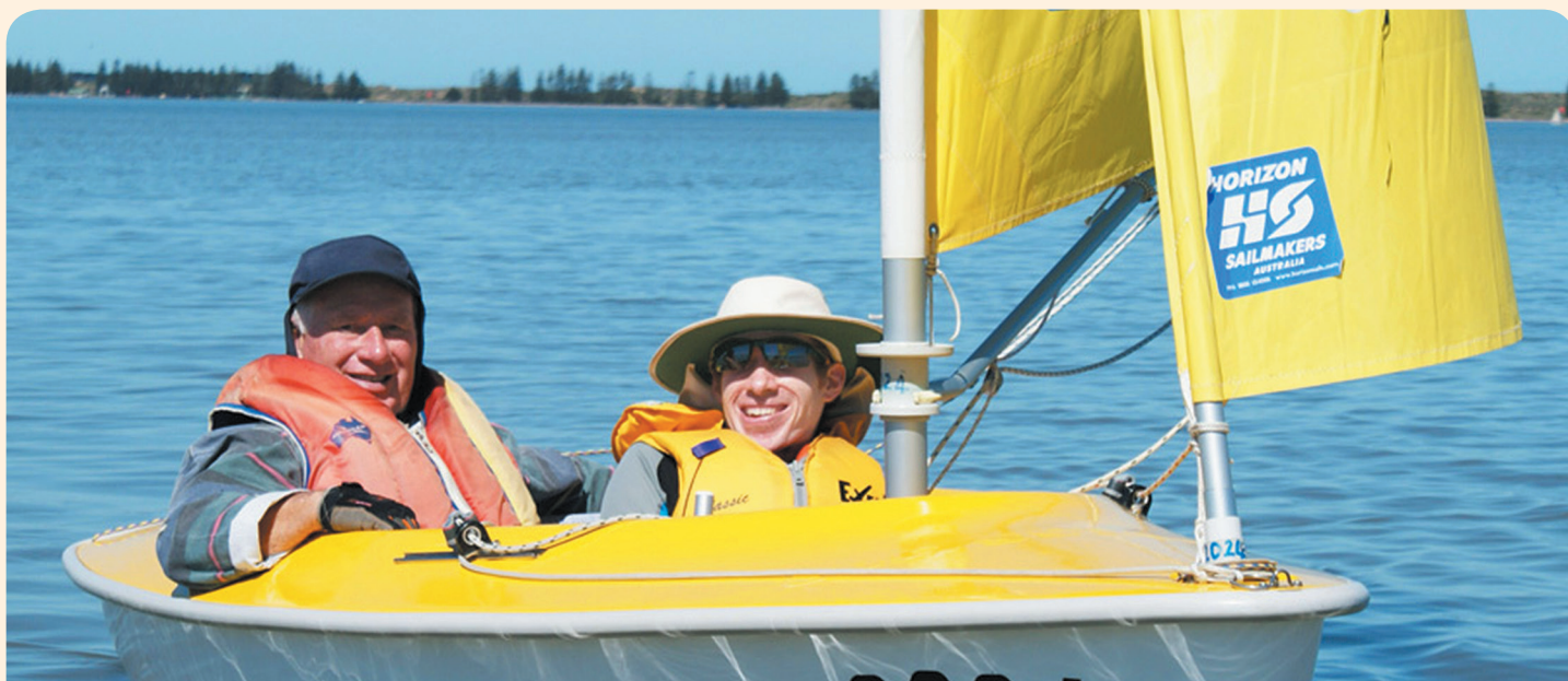
All clients who have sailed, have thoroughly enjoyed the experience

The program run by the Goolwa Regatta Yacht Club is run on Saturdays on a monthly basis. Access into and out of boats is easily arranged and lifting equipment is available if needed. If sailing floats your boat, more information can be obtained on the club's website www.gryc.com.au/sailability .